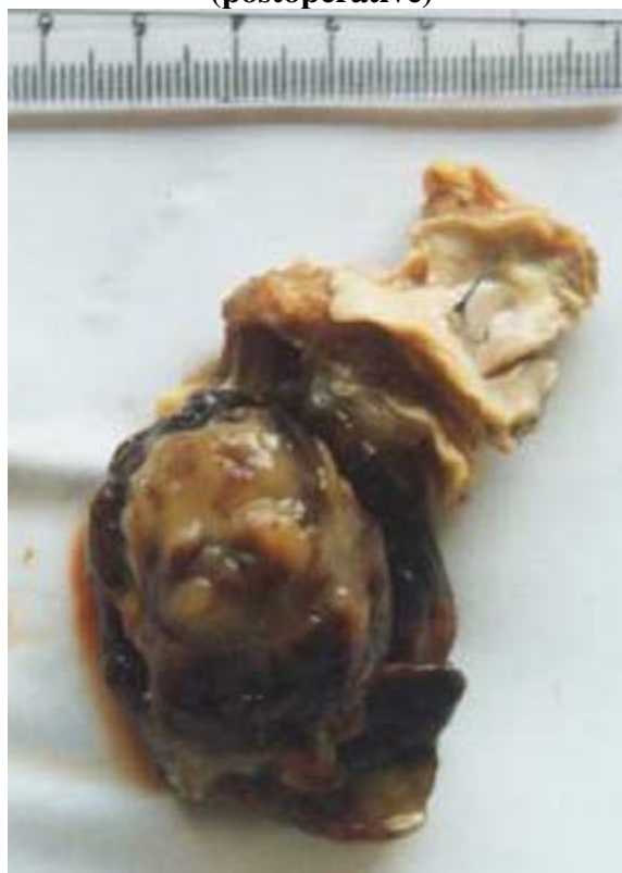
Figure 3: Macroscopic image of myxoma (postoperative)

Histologically, the tumor had the typical appearance of a benign myxoma composed of gelatinous appearing material with few cells and no mitotic activity.